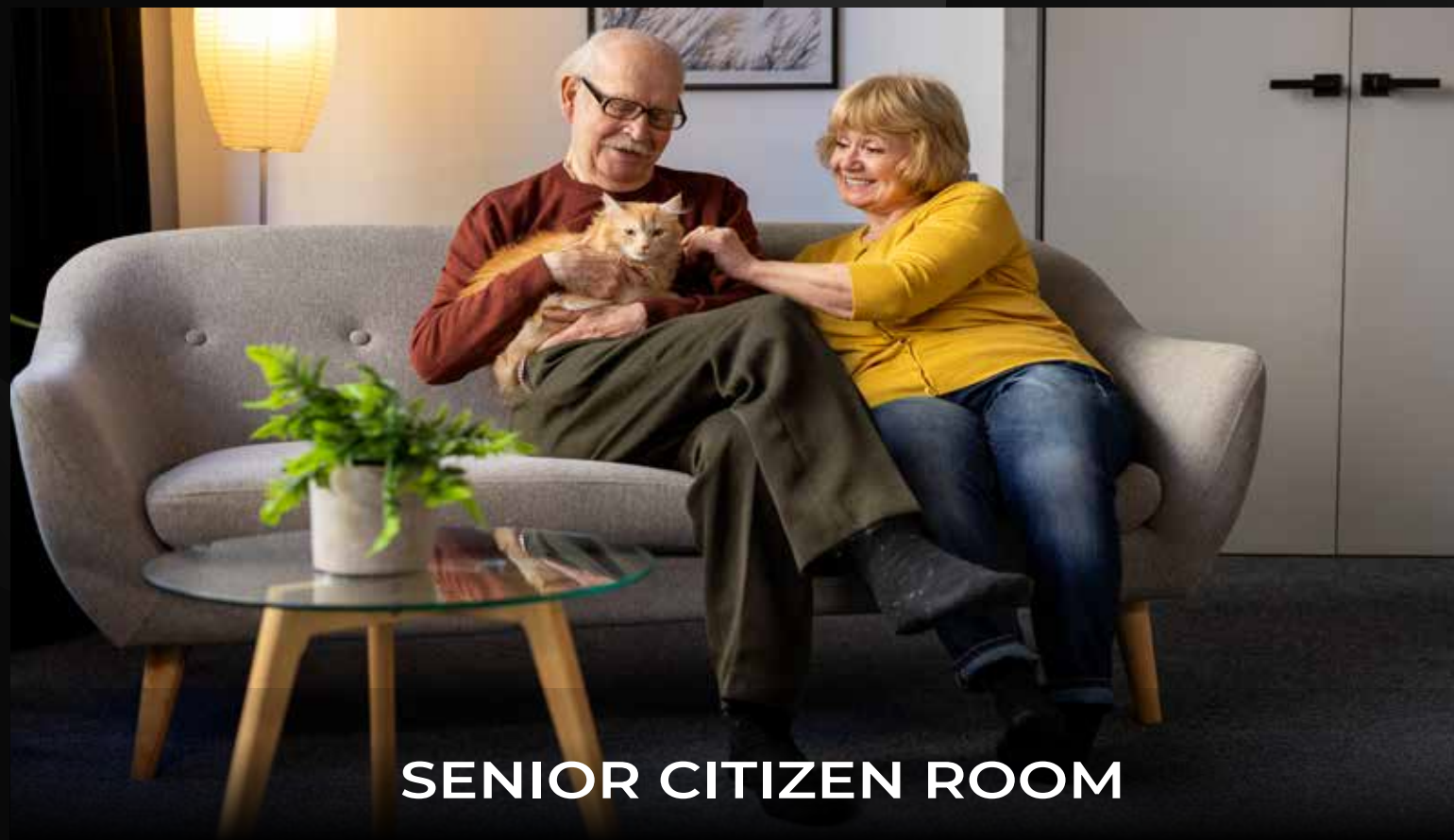
SENIOR CITIZEN ROOM