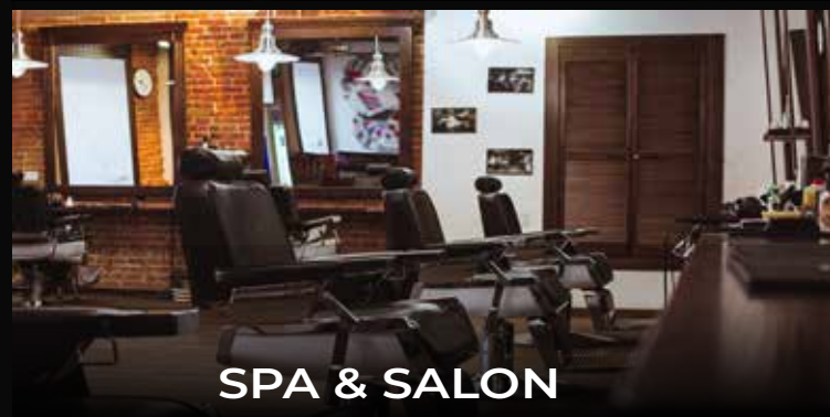
SPA & SALON